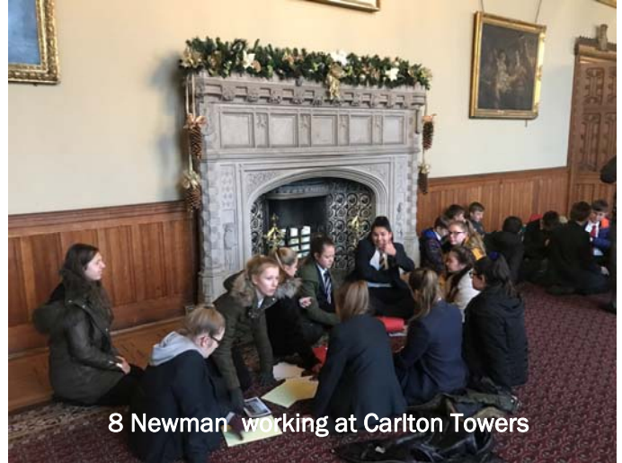
8 Newman working at Carlton Towers

Next stop was Carlton Towers itself, where pupils were given guided tours and shown the celebrated priest's hiding hole. After lunch, Year 8 took part in a workshop on St. Oscar Romero and this was linked with Blessed Thomas Thwing. The day ended with some personal reflection on remembering those people who are no longer with us but who led good lives .