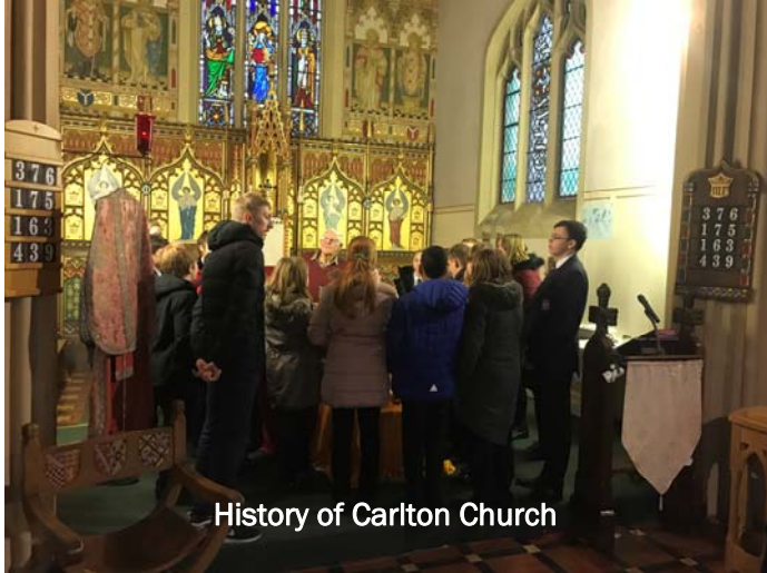
History of Carlton Church

Year 8 Faith Day On 22 November, Year 8 took part in a Faith day which started off with a walk down to the local church, St. Mary's, Carlton. While the pupils were there they did various activities such as exploring and identifying the features of a church. They learned about the rich Catholic history of Carlton including information on Blessed Thomas Thwing and his connection with Carlton Hall, now known as Carlton Towers.