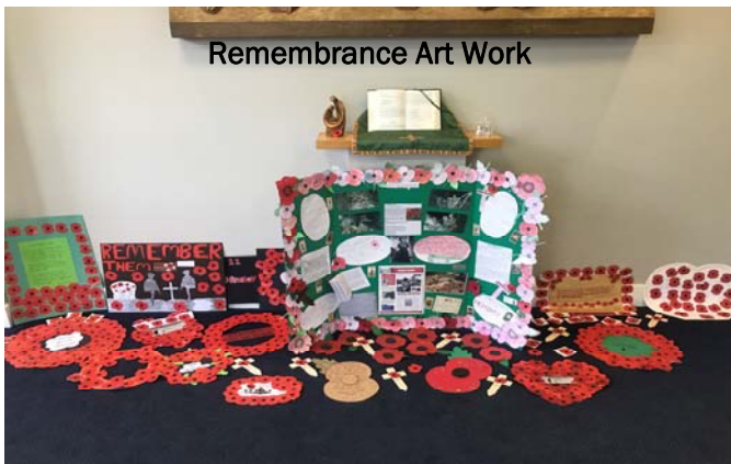
Remembrance Art Work