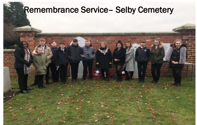
Remembrance Service- Selby Cemetery