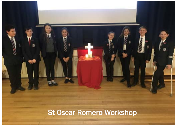
St Oscar Romero Workshop