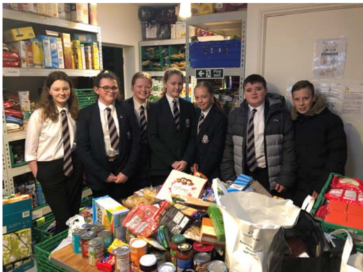
Selby Food Bank Donations - Year 8 Catholic Life group dropped off the generous food donations to the local Food Bank in Selby. The group had done so well, bringing in donations they went to Costa afterwards for a little treat.