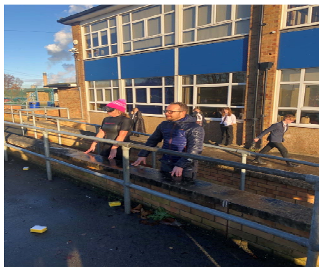
World Gifts: Forms have arranged fundraisers in order to raise money for World Gifts. There have been many different ideas from bun sales to throwing sponges at the teachers.