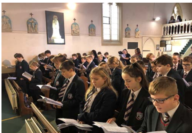
Service of Light: The Year 7 Service of Light took place on Friday 13th December. Pupils took part in various ways including reading and processing. In preparation for the service, pupils created Advent stars which included the names of people for whom they wanted to pray.