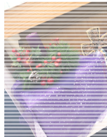
Preparing for Advent: Catholic Life pupils decorated the Chapel in purple and pink for Advent. An Advent wreath was created for the reception and instead of one wreath in the chapel the candles have been decorated with their own individual wreaths. The Chapel looks lovely. The group are doing really well and are very enthusiastic about the work they do. Many forms decided to purchase an Advent Calendar for pupils to open each day in the countdown for Christmas. These calendars follow the Christmas story.